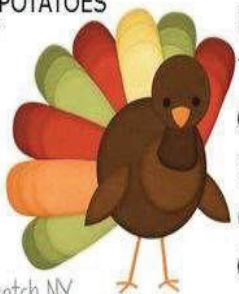
Chicken Scratch NY

N S T U F F I N G I R L U N Y F G K D A E R B V G C A D Q E A B E A N S I L S O R Q G S K O G K E I P E L P P A P A E R N R O C M L W U Q D N G O O U U E J L X E S M S Y B Z O T T Z P U M P K I N P I E V N A Z H B O J I L C F A G R Y F T V N E M Y K U S L L O R Q K O X K S A B Y Q T Z H W Y P S P K T G H S A U Q S O R S J L T A G M A S H E D P O T A T O E S Z D L U C W F Z L M U K S E K C A K C G T H T T I C R N W B G J X S G R A V Y I E Q I S T