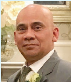
MEMBER, PASTORAL COUNCIL CHAIR, MINISTRY OF LECTORS