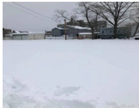
Church Parking Lot

This week's snowstorm is part of God's humor. He knows our situation; yet He allows this to happen. Indeed, only He who knows the reason. However, ours is the responsibility to discern and take some actions. Let's help St. Anthony's parish.