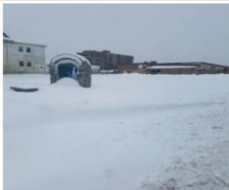
School Parking Lot