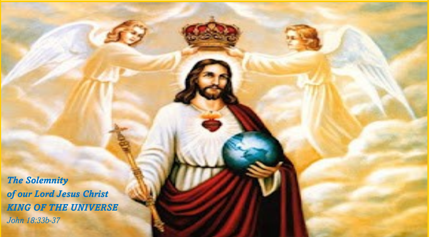
The Solemnity of our Lord Jesus Christ KING OF THE UNIVERSE John 18:33b-37

63 Franklin Street (Silver Lake) Belleville, NJ 07109